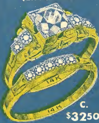
C. $3250 Bridal Set with 10 Diamonds. Both rings 14K yellow gold. $3.15 a month