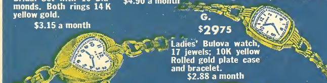
F. $1995 Newest style 17 jewel Heart Watch in 10K yellow rolled gold plate with bracelet to match. $1.90 a month