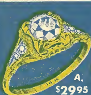
A. $2995 5 diamonds arranged nicely. New style ring. 14K yellow gold. $2.90 a month