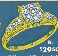
B. $2950 7 diamond Cluster; half carat size. 6 other diamonds. 14K yellow gold. $2.85 a month