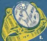
E. $1695 Man's Initial Ring; 2 initials and diamond on black onyx. 10K yellow gold. $1.60 a month.