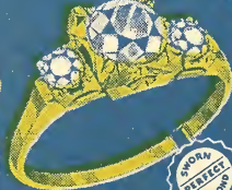
D. $50 Sworn Perfect Diamond; 2 other diamonds; 14K yellow gold $4.90 a month