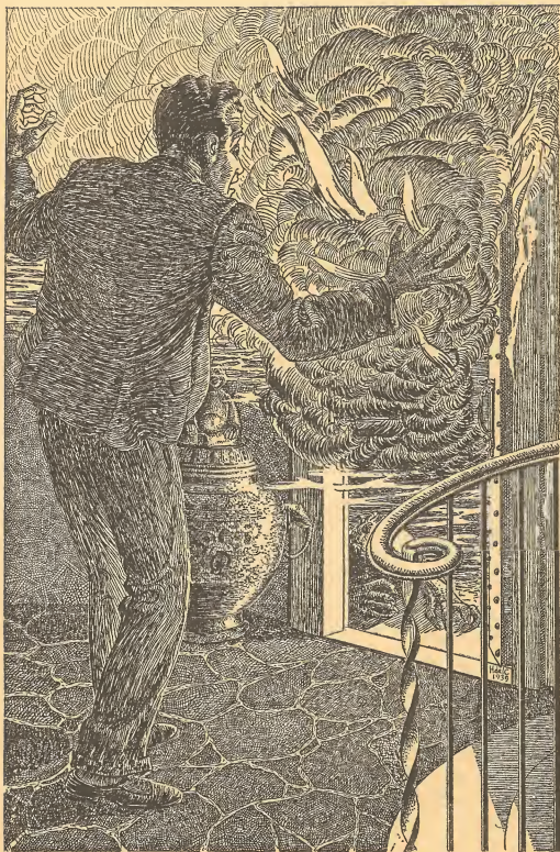
A blast of searing flame poured out through the portal